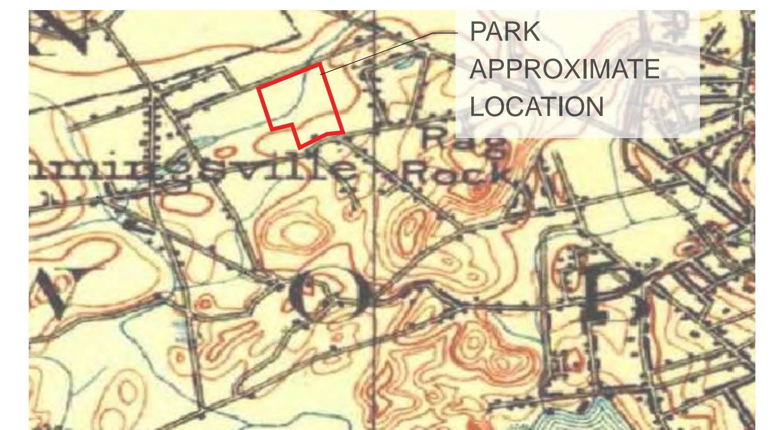
HISTORIC MAP - 1903