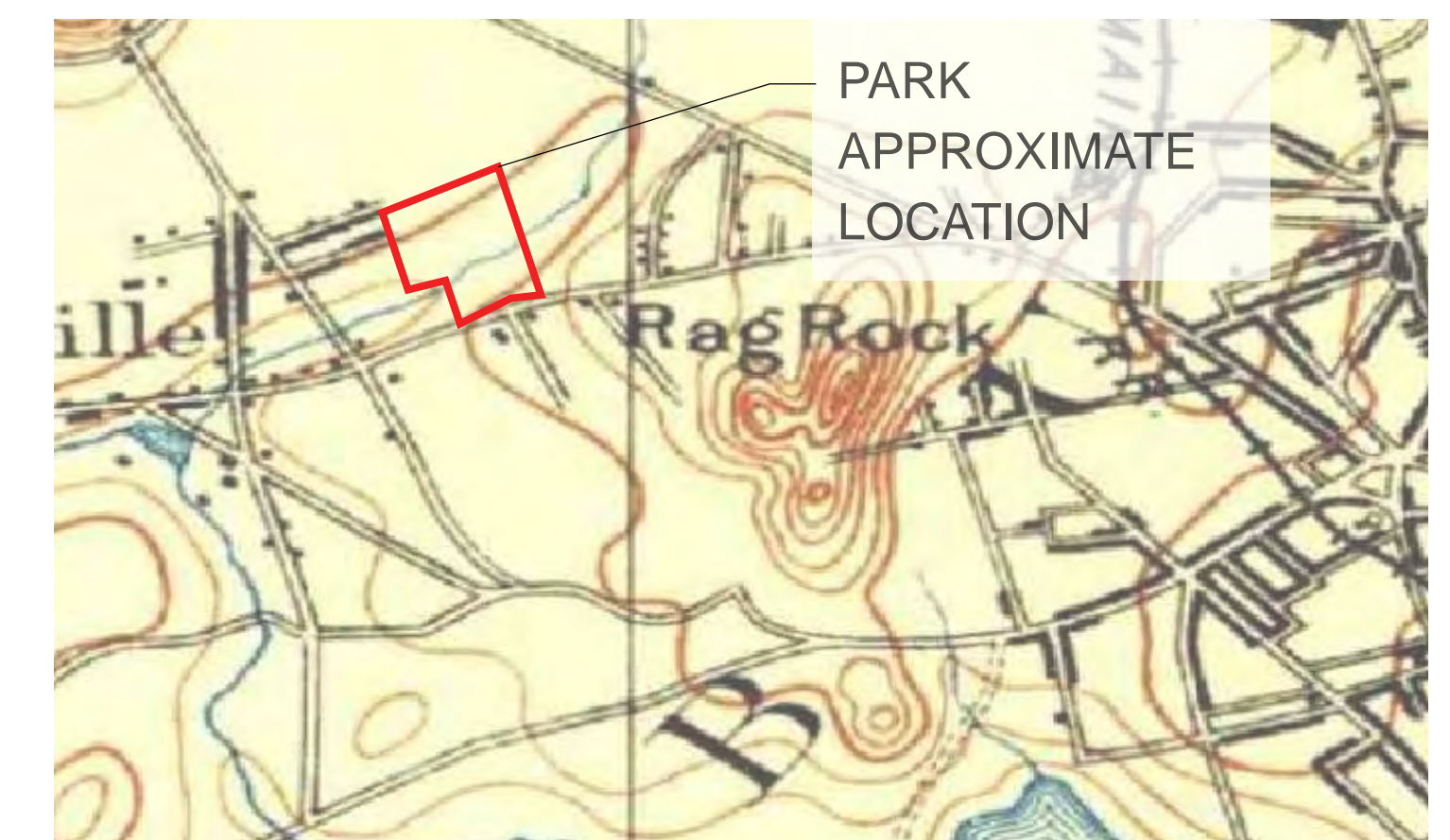
HISTORIC MAP - 1893