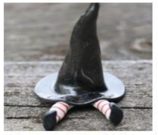
Project 1: Haunted Hat: Molding and slabs will be our technique for this cute