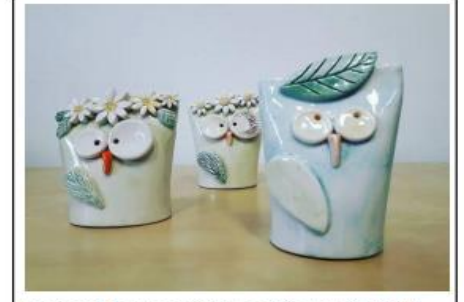
Project 4: Fancy Owls, This project will showcase attention to detail, using a combination of techniques.