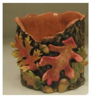
Project 1: Fall candle holder: We'll create a candle holder with inspiration from nature and use leaves as templates.