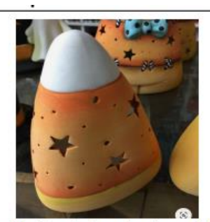
Project 2: Candy Corn Lantern: with the pinch pot and slab technique we'll create a beautiful Halloween lantern for the season