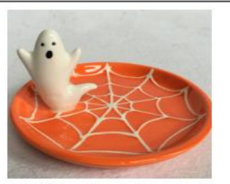
Project 3: Ghost Dish; with a combination of techniques we'll create this candy dish just in time for Halloween.