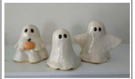
Project 2: Friendly Ghosts: We will roll slabs and mold little ghosts for the holiday.