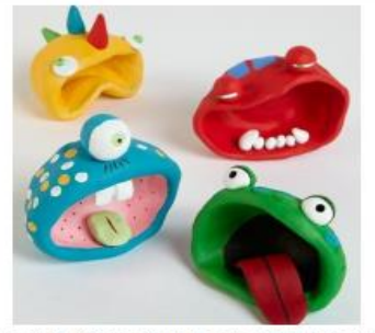
Project 3: Colorful Monsters: Using the pinch-pot technique and sculpture we will explore creativity and color!