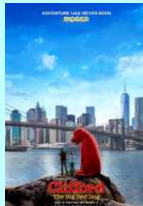
Clifford the Big Red Dog Tuesday, August 2 nd