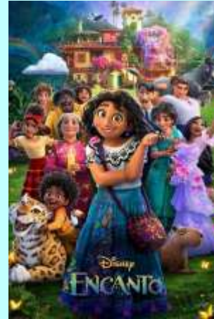
Encanto Tuesday, July 19 th