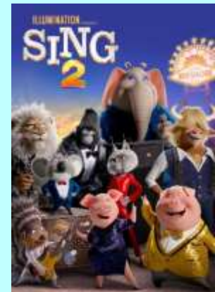
Sing 2 Tuesday, August 9 th

All Movies are free of charge and begin as soon as it's dark enough to view the screen. We suggest you arrive early to pick out space on the lawn. Feel free to bring snacks & drinks with you, but in an effort to help keep our parks clean please make sure you take all your trash with you when you leave! Please also be respectful of others watching the movies by keeping talking to a minimum while the movie is showing!