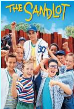
The Sandlot Saturday, June 18 th