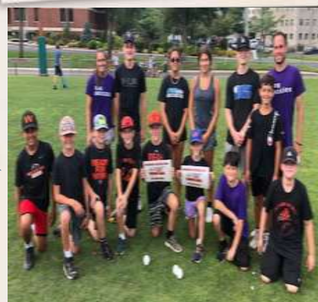
2021 Wiffleball Champions